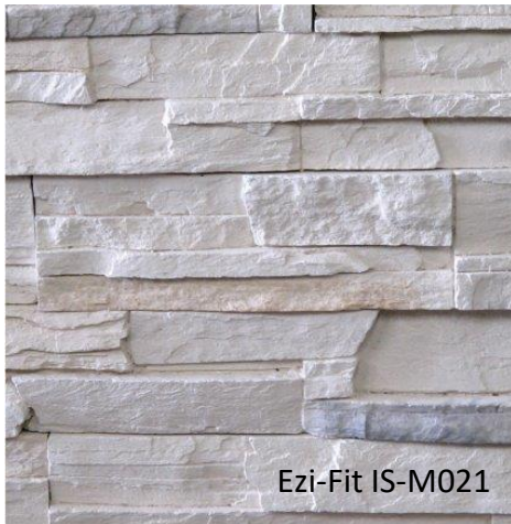
Colour – off-white base with splashes of tan and grey feature tones