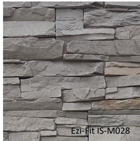
Colour – grey base with splashes of tan and dark grey feature tones