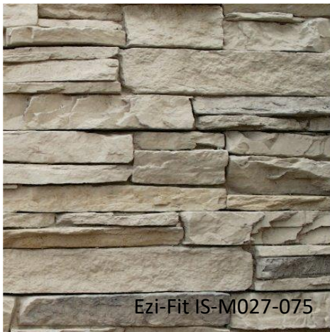
Colour – beige base with splashes of tan and grey feature tones