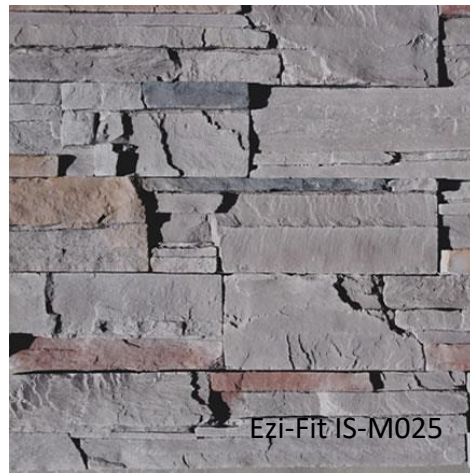
Colour – dark grey base with splashes of tan, red browns and dark grey feature tones