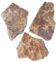
Typical Flat profiles