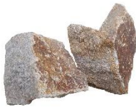
Typical Corner profiles