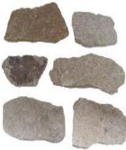
Typical Flat profiles