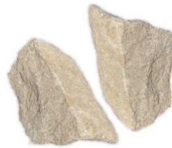
Typical Corner profiles