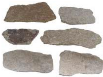
Typical Flat profiles