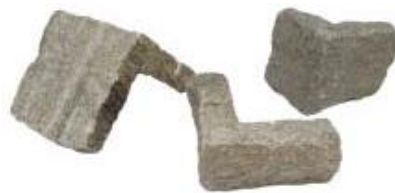
Typical Corner profiles